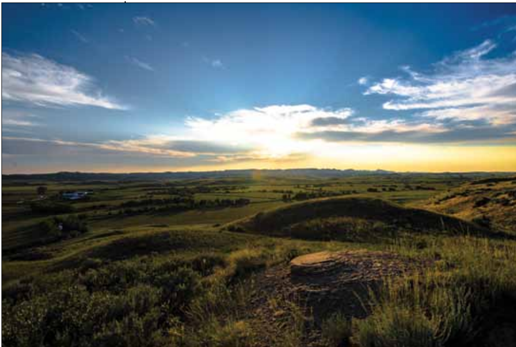
Otter Creek Valley.

Montana until they become acquainted with eastern Montana.”