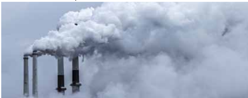
Colstrip coal-fired power plant.

So what conclusions can be drawn about the future of the Colstrip plant? #1 - The two older units are dirty and increasingly unprofitable. #2 - There is a valuable resource in the existing transmission system that moves electricity to West Coast markets, but those markets want cleaner electricity. #3 - There are far cheaper and cleaner ways to generate electricity than burning coal. Proposals for geothermal and wind energy at or near the Colstrip plant are being considered. #4 - Montana needs political leaders who differentiate between the town of Colstrip and the Colstrip plant, and focus on helping the community diversify its economic base.