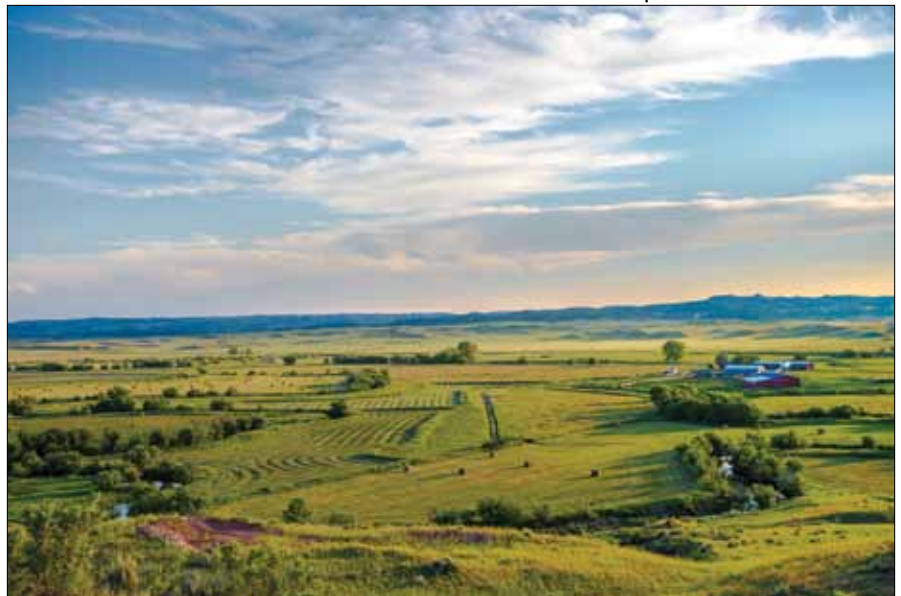
Otter Creek Valley.

But the people who cared for EOB stood their ground. They organized, they attended every meeting, and they fought tooth and nail for their home. The proposal was contested every step of the way by native Americans, ranchers, activists, lawyers, and concerned citizens, all of whom saw this project for what it was: a temporary money-making scheme that would take private property, destroy cultural sites, pollute water, and contribute to global warming – all for the sake of allowing an international corporation to profit by shipping coal to Asia.