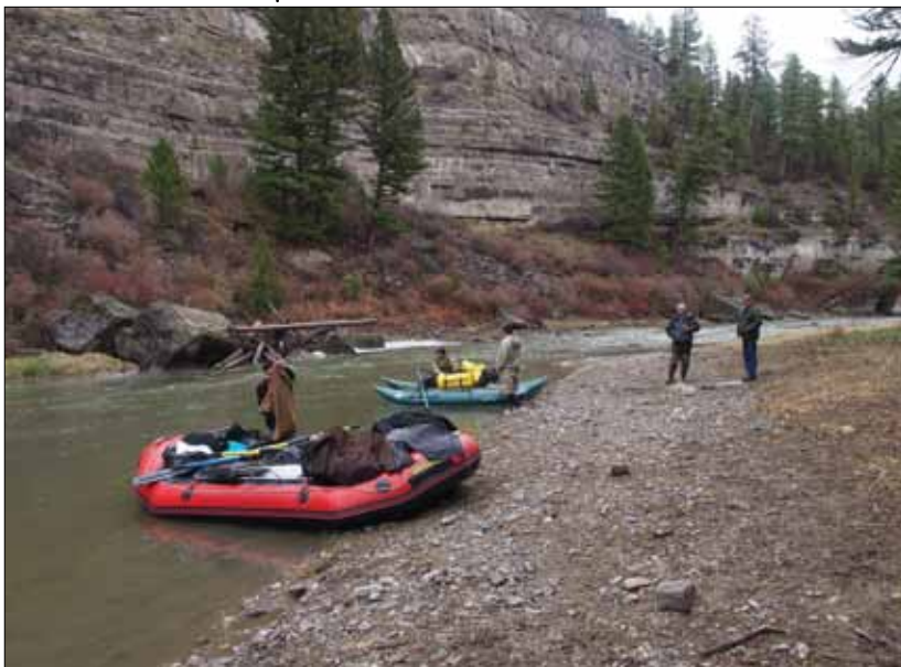
Smith River.

62-page deficiency letter outlining some of the problems associated with the application. Unfortunately, DEQ did not identify all of the missing or incomplete information that it