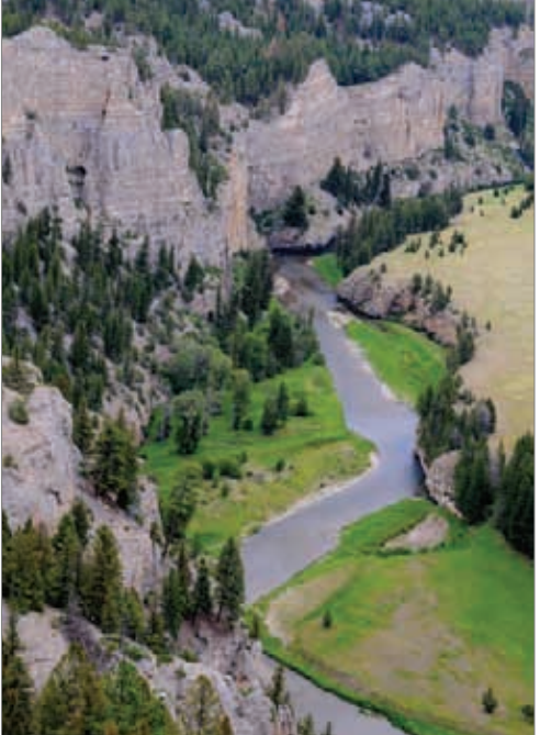
Smith River.

"Shortly after Sandfire made the decision to invest in Tintina, the Centre for Australian Ethical Research issued a report that criticized the corporation for its environmental and social practices. The findings were damning enough that Australia's top university ... decided to divest its holdings of Sandfire stock ...."