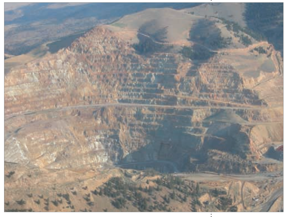
Golden Sunlight mine.

To read the briefs in the case, go to MEIC's web site, www.meic.org. <sup></sup>€