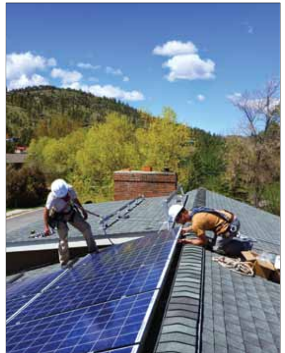
Solar being installed on a Helena rooftop.

NorthWestern has broken ground on a pilot project near Deer Lodge that will help the utility assess how solar and battery storage can work together to maintain grid reliability. This experimental project will serve 17 customers.