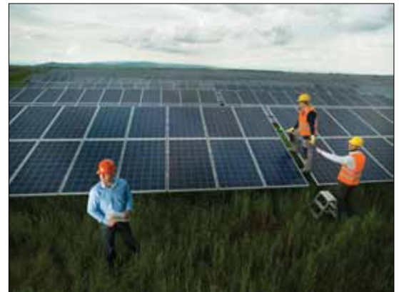
Utility scale solar project.

All the projects described above are positive signs that the state's energy mix is becoming cleaner and more diverse. There is a lot to learn from each of these projects. Most importantly, these projects will help utilities, and ultimately their customers, save money and avoid the economic and environmental risks associated with dirty fossil fuel projects. What is certain is that the future is bright for solar energy development in Montana and across the United States. ☺