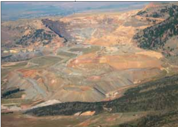
Golden Sunlight Mine.

The latest lawsuit is on appeal to the Montana Supreme Court after Jefferson County district judge Loren Tucker ruled for DEQ and GSM. Unlike the situation of the first three lawsuits, MEIC was able to appeal this ruling. In the three previous suits, the court ruled in MEIC's favor. In each instance, the State and GSM did not appeal those decisions but instead went to the Legislature for relief. Three times the Legislature passed retroactive laws to undo the rulings. Such is the corrosive power of the mining industry in Montana. Let's hope it does not extend to the Montana Supreme Court.