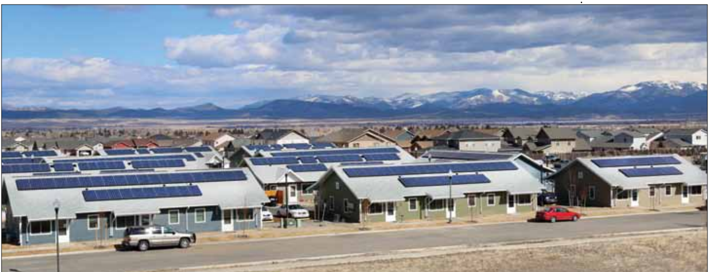
A large solar energy installation in Helena.

“Most importantly, these projects will help utilities, and ultimately their customers, save money and avoid the economic and environmental risks associated with dirty fossil fuel projects. What is certain is that the future is bright for solar energy development in Montana and across the United States.”