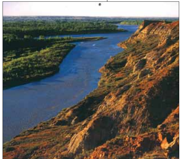
Yellowstone River near Sidney.

“There is no doubt that those tiresome and prolonged efforts to stop the pipeline ultimately made a difference. This was a victory because of people power, and we thank you for it.”