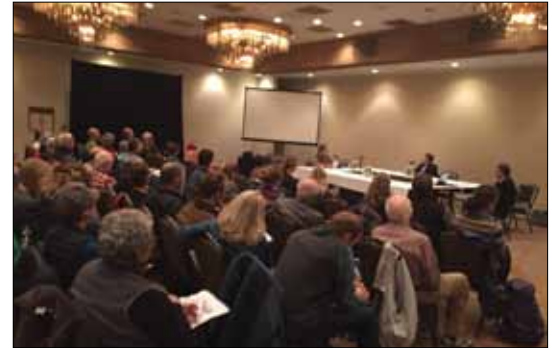
A packed house at the Missoula hearing.

For more information and talking points for comments you can go to: meic.org/get-involved