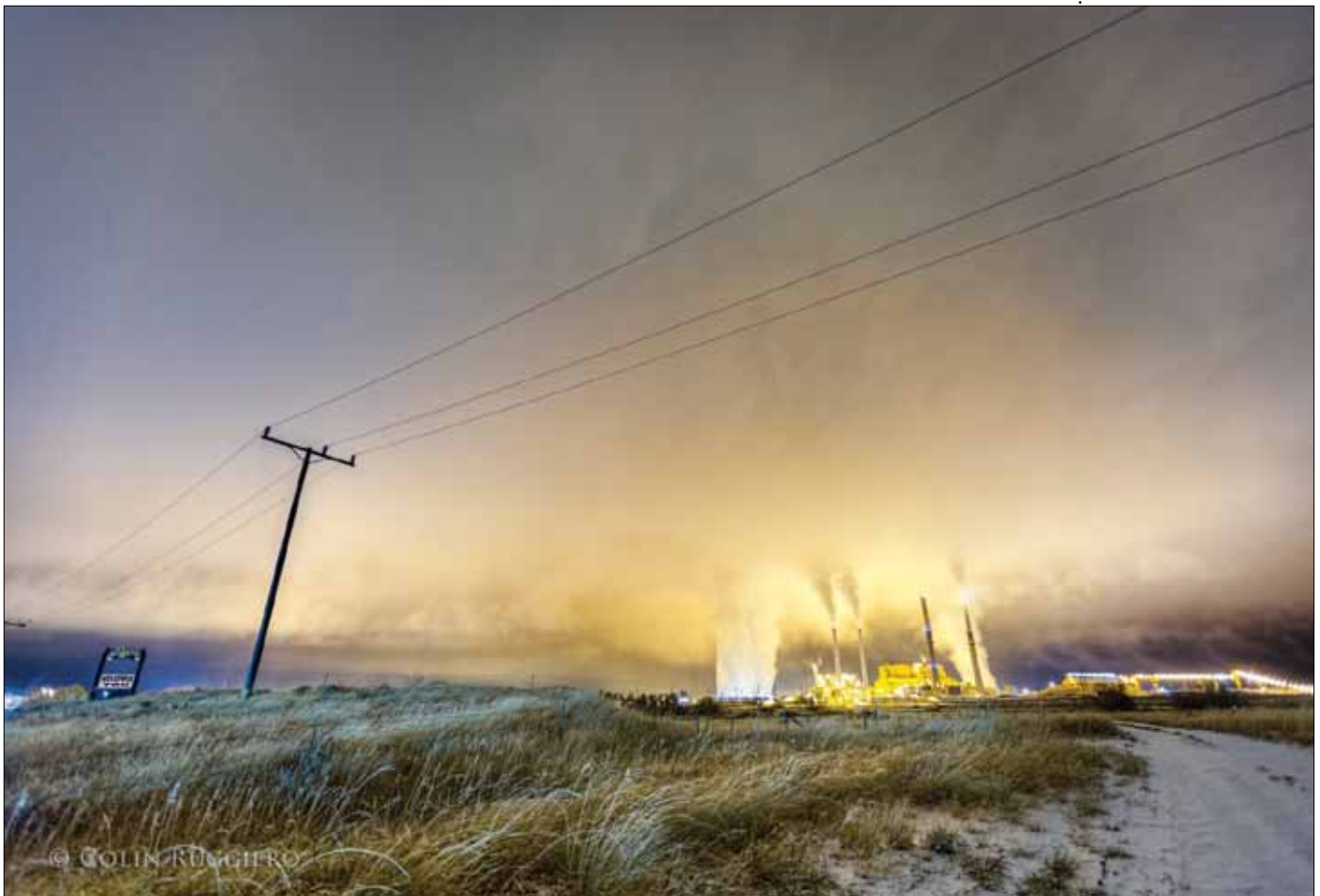
Colstrip.

The environmental impact statement for Colstrip Units 1 & 2, which was prepared in 1973, repeatedly said these units would have a 30-year life span, and that "alternate energy sources will probably emerge as economics dictate their practicality." Forty years later, it seems that this prediction is finally coming true. ☺