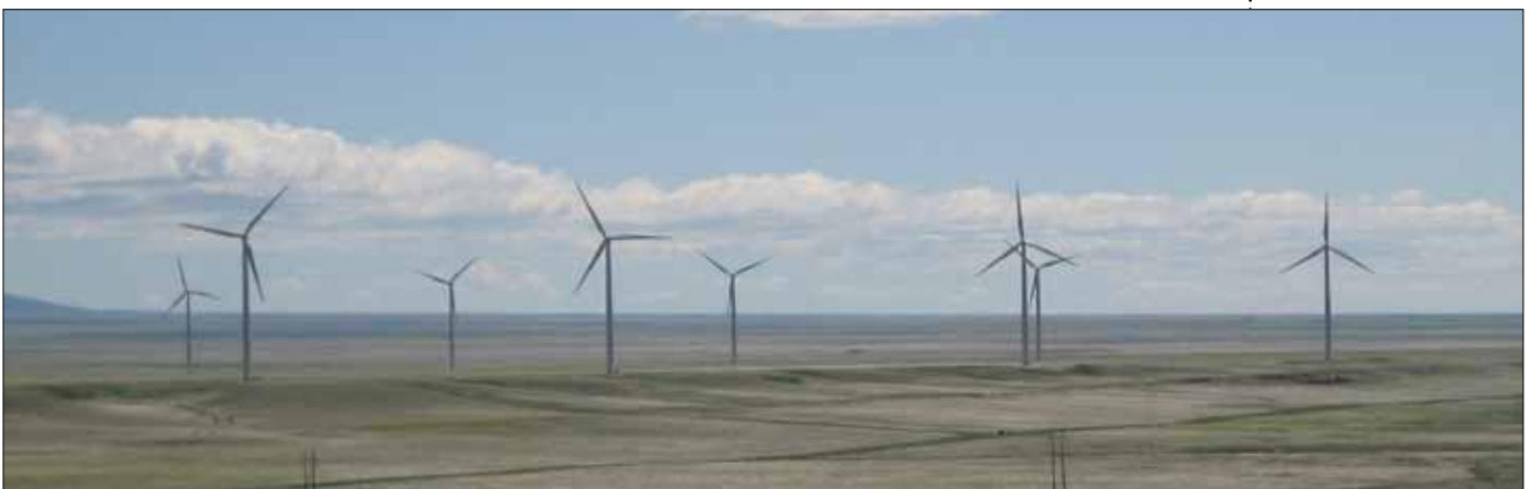
Judith Gap wind farm.

Fortunately, Pres. Barack Obama is sticking to his guns on the Clean Power Plan with a determination rarely seen in an American president. The Clean Power Plan not only requires the largest sources of carbon pollution in the U.S. to significantly reduce their emissions, it also sends a critical message to other countries that the U.S. is serious about tackling climate change. That message is essential if the Paris climate negotiations are to be successful. ☺